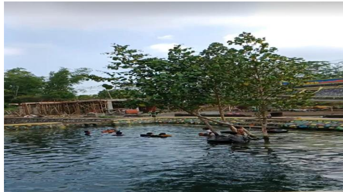
Figure 1. Liprak Kulon Tourism (Virgin Spring)