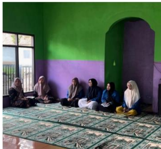
Figure 3: Accompanying Yasinan activities at Musholla Darul Ulum

At the stage of the implementation of the routine yasinan and diba'iyah activities in Condong Kidul village, the congregation usually starts with bertawassul to the elders and also the masyayikh and continued with the reading of the yasin letter from the Qur'an, after reading the letter, the congregation will read the yasin letter from the Qur'an, yasin the congregation is led to read tahlil for the deceased and al-marhumah.