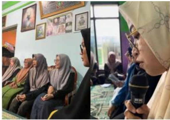
Figure 4: Briefing residents on the importance of yasinan and diba'iyah