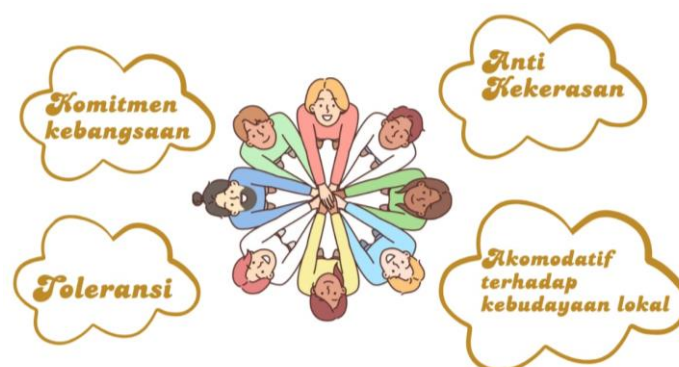
Picture 5. Indicators of Religious Moderation