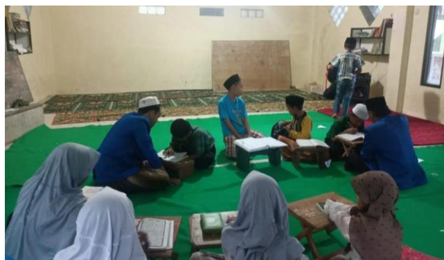
Picture 6. Documentation of Character Building Aspects for Students in KKN Activities

The above findings illustrate the importance of the Community Service Program (KKN) as an effective platform for implementing the values of religious moderation in the community. Based on the findings above, the before and after effects of the application of religious moderation in the community service program are listed in the following table: