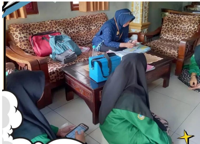
Picture 4. Documentation of Participation Aspects of Community Building in KKN Activities

The role of universities, both in terms of curriculum and the broader academic and social environment, is considered important in promoting and strengthening religious moderation among students (Rahman, 2023). This includes the integration of moderation-related content into the curriculum, the role of faculty in building and strengthening religious moderation, and the importance of student organizations and digital literacy in supporting and disseminating tolerant and moderate religious values. The discussion around religious moderation in higher education also extends to broader social implications, emphasizing the role of students as leading advocates of religious moderation.