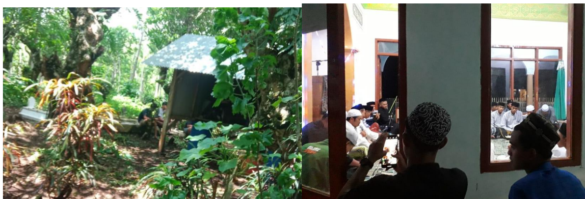
Picture 3. Documentation of Tolerance and Respect for Cultural Diversity Aspects of KKN Activities