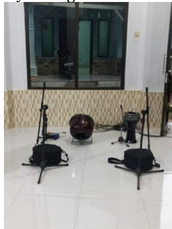
Picture 2. Preparing The Pilgrimage Equipment

The first step is to prepare a sound system. This sound is an inventory facility for the Gading Wetan community through Rotibul Haddad activities.