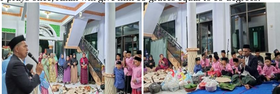
Figure 7: Implementation of Rotibulhaddad Activities And Isra' Mi'raj Events

The sixth step, namely the reading of the Prophet's prayers, is the final stage "Whoever prays once, Allah will give him 10 graces equal to 10 degrees."