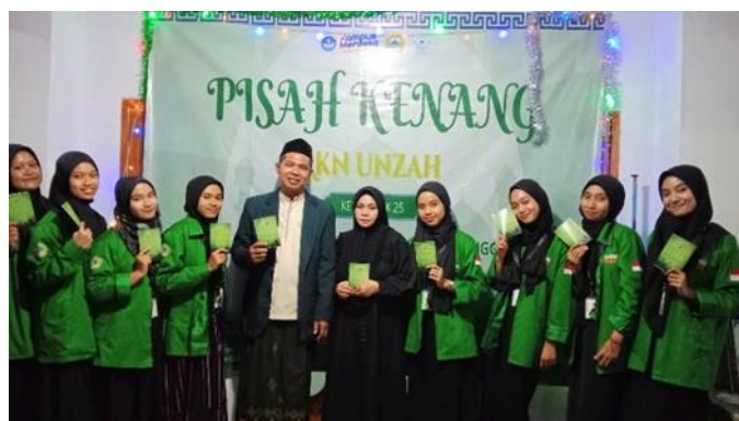
Figure 9: Giving the Repaired Rotibul Haddad Book to The Head of TPQ

The impact of improving the rotibul haddad book is to make it easier to read rotibul haddad for students, especially the public. because we can see that some of the members of the rotibul haddad activity are elderly people, so for this reason, we think that improving the rotibul haddad book will be very useful.