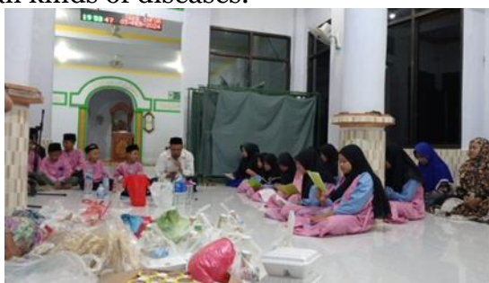
Figure 5. Recitation of Rotibul Haddad

The fourth step is to put water for prayer, where people believe that the water they pray for can cure all kinds of diseases.