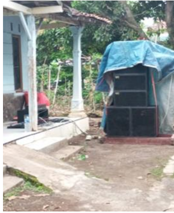
Picture 1. Preparing Sound System

The first step is to prepare a sound system. This sound is an inventory facility for the Gading Wetan community through Rotibul Haddad activities.