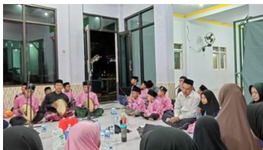
Picture 4. Putting Water To Pray

The fourth step is to put water for prayer, where people believe that the water they pray for can cure all kinds of diseases.